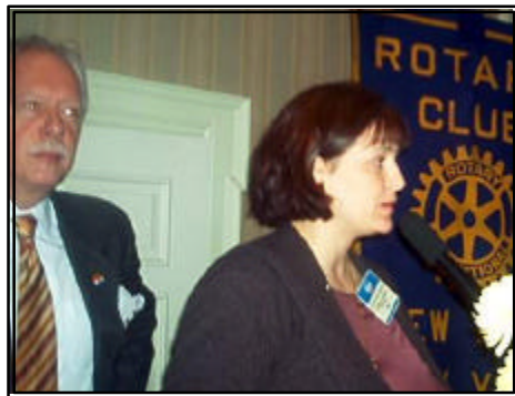
In support of the troops, member and CEO of Crossroads Publishing, will generously donate 80 books to the care packages that club will be sending out on December 10 th . But more is needed.